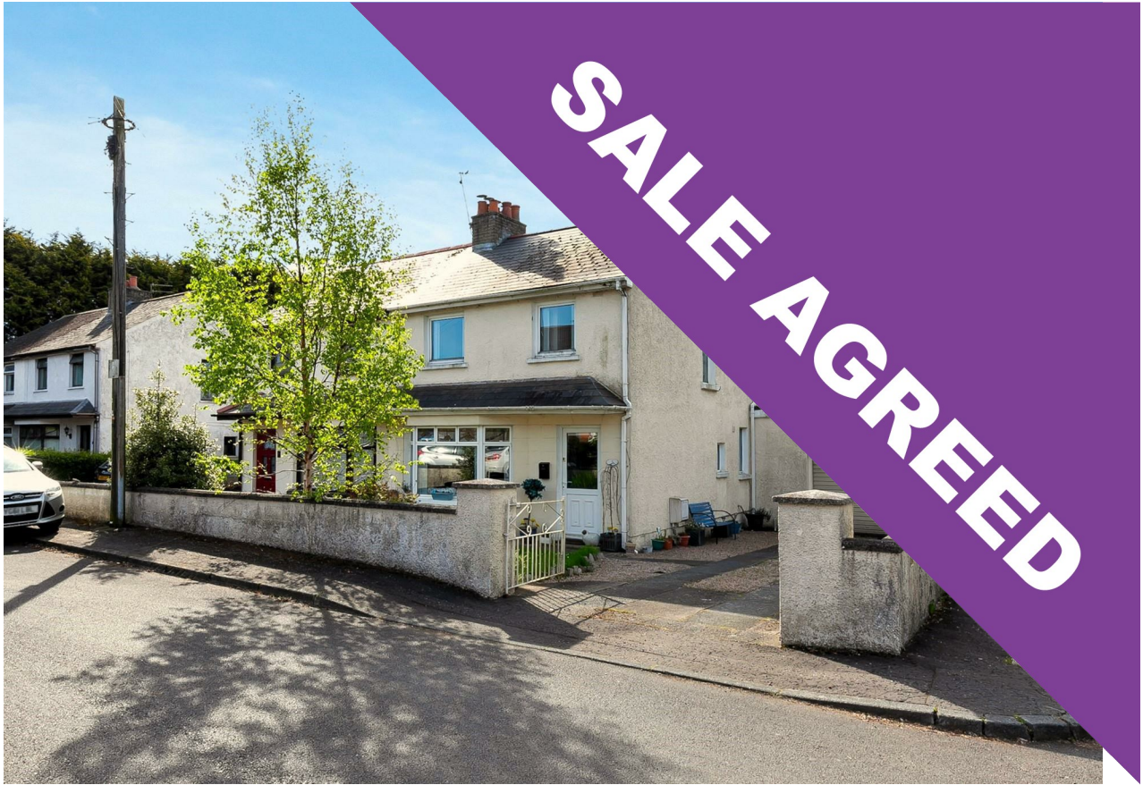
5 Hillview Drive, Newtownabbey, BT36 5HG